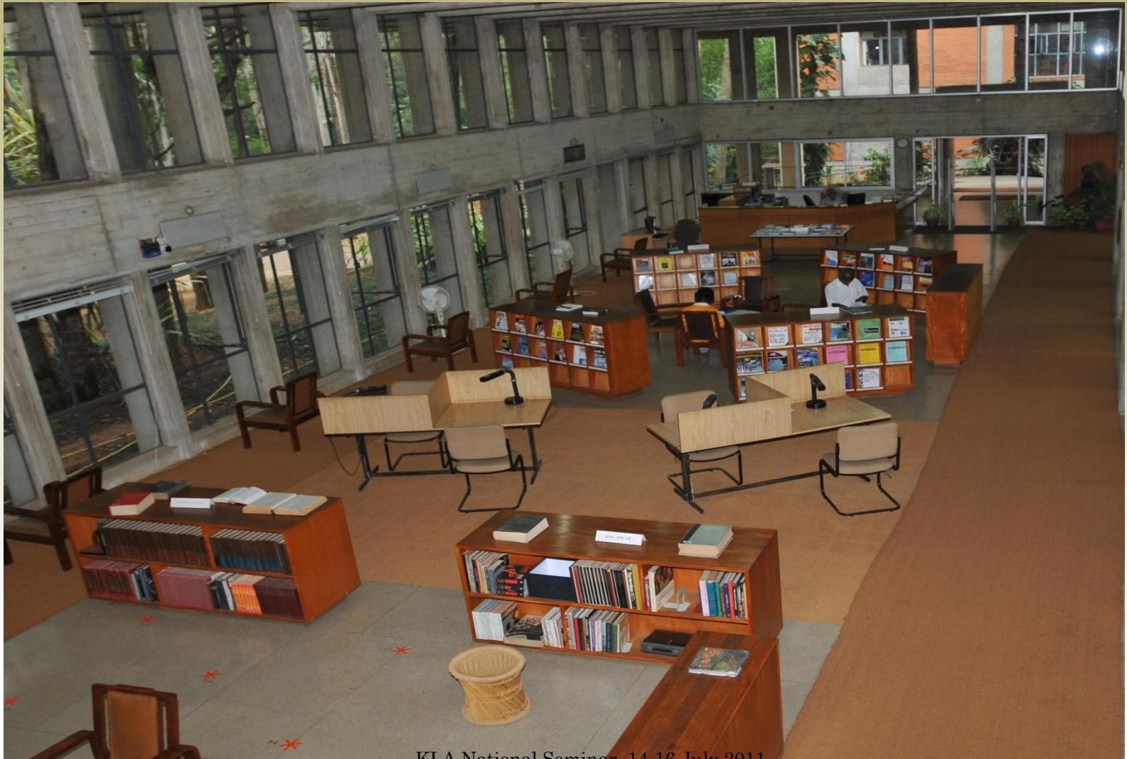
KLA National Seminar, 14-16 July 2011, Thiruvananthapuram